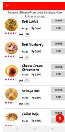
Figure 3. Result of SMART method