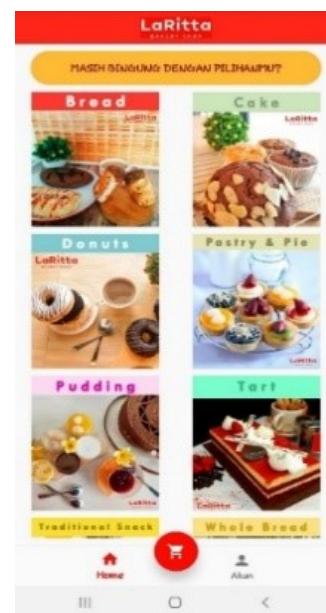
Figure 2. menu display user based on Android App

Applications that are used by Android-based customers are designed for registration, application login, selecting products, transactions, checking orders, and rating orders that have been made