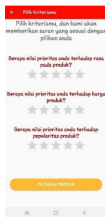
Figure 4. criteria selection form