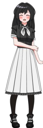
Figure 3. The character of Kak Lita

The explanation will be delivered by “Kak Lita”, the guide for the library tour. The character for “Kak Lita” is derived from an asset made by “CRUG63R” called “Nozomi FREE Customizable VN Character”. the aforementioned character can be seen on Figure 3 and the example of the character inside the game can be seen on Figure 4.