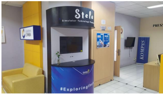
Figure 5. One of the image for “ruang kompas”

Royalty free soundtracks made by shimtone (シムトーン) is used for the background music, few of the musics used for the game are: