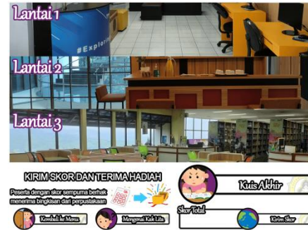
Figure 2. Floor selection UI inside the game

The UI design is using various clip arts from Irasutoya. One of the UI can be seen on Figure 2.