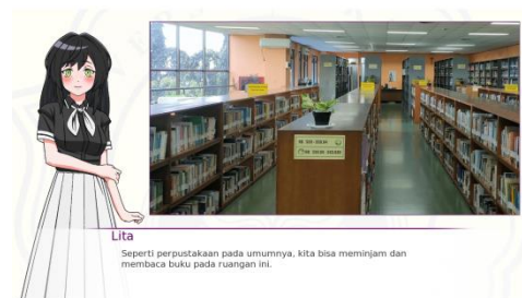
Figure 4. Kak Lita explaining

While listening to the explanation, the players will see various images associated with particular facilities or rooms that are being explained. One example of the photo can be seen on Figure 5.