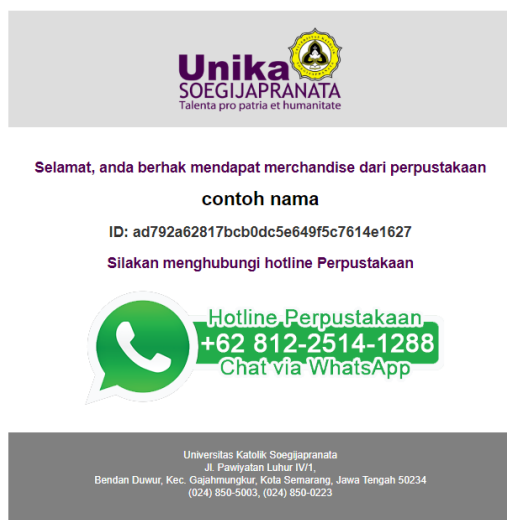
Figure 6. Example of an email being sent to a player

After the player finished all the quiz and reached the maximum score, they can send their name and email to the library’s MySQL database. Afterwards the player will receive an email from an automated address. The example of the email can be seen on Figure 6.