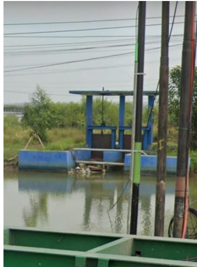
Figure 4. Loireng village sluice gate