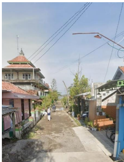
Figure 3. Roudhlotus Sholihin Islamic Boarding School, Loireng

The Loireng Village Government has tried to anticipate tidal floods by raising village roads. However, the problem is, if only the roads are raised then the roads will be higher than the foundations of people's houses. Logically, if flood water passes through higher roads, the water will come down and attack people's houses. This will be very detrimental to the affected residents, because not all residents are economically able to raise the foundation of their house to the same level or higher than the road itself. Gus Qodir also refused to raise the road, and he had an opinion that tidal flooding in his village could be handled by water pumps. More water pumps must be used when tidal floods occur by moving flood water into rivers. However, problems occur when the river, which is the target for storing water, becomes shallow due to sedimentation while there are no active sewers in residents' homes. Therefore, what can be done to overcome tidal flooding is by using a water pump drainage system and normalizing rivers and ditches.