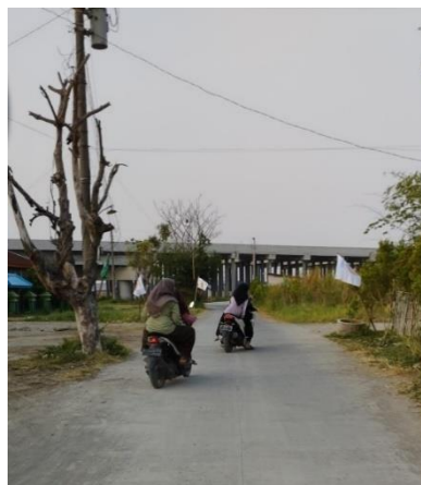
Figure 2. Sayung-Demak Toll Road in Loireng Village

Apart from that, the impact of the development of the National Strategic Project (PSN) in Demak Regency has not paid attention to the sustainability of environmental effects. For example, the construction of the Semarang–Demak toll road apparently indicates a weak AMDAL (Environmental Impact Assessment) planning (Gustaf, 2022). This resulted in loss and damage to drainage flows in villages that crossed the toll road project, causing major flooding in early 2023.