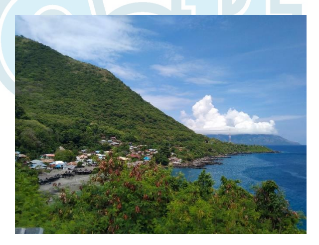
Figure 1: Lamalera B Village in Lembata District, East Nusa Tenggara.

In Lamalera B village there is one government bank agent, namely an agent for Bank Rakyat Indonesia, and one Nusa Tenggara Timur branch office bank. The facilities of this financial institution are used by residents of the two villages to receive and send money. The existence of this facility also shows that residents of the two villages carry out financial transactions. This transaction shows that residents have economic income from outside and residents also send money abroad, especially for the education costs of children outside Lembata. Lamalera was a village, which the traditional fishing community of Lamalera called lefo . Below is a photo of Lamalera as lefo and as a part of Indonesia's modern state.