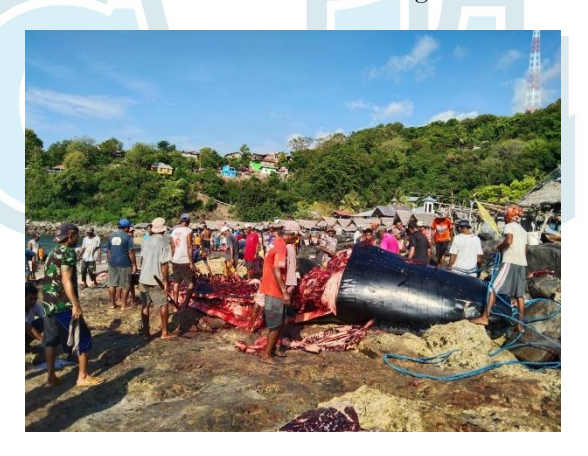
Figure 3: Distribution of whale meat on Lamalera Beach in November 2022.

The resource person was interviewed by researchers in August 2022 in Cibubur. He said that the traditional fishing community of Lamalera has several expressions related to this series of capabilities, namely "to the sea", "at sea", and "to go to sea". "To the sea" means that the Lamalera people orient their lives towards the sea. "At sea" means that every fisherman while at sea has a mandate from the village to bring back whales and sea fish to fulfill the villagers' need for food (figure 3). Meanwhile, "going to sea" means catching whales and other fish as an activity of life. Therefore, the social capability "ola nua-lefa nua" is a life activity with a social-ecological dimension. In other words, ola nuânglefa nué is a series of social-ecological capabilities contained in the life universe of the traditional Lamalera fishing community. This series of capabilities is an ethical value that is actualized in social life in Lamalera village.