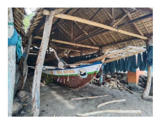
Figure 4: Sailboats parked in the nation on the shores of Lamalera Beach. Source: Alexander Aur's personal collection, November 2022

so that it remains focused on the shared vision led by the lamafa on the bridge of the sailboat.