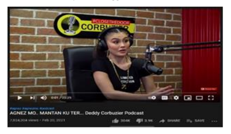
Figure 4: Deddy Corbuzier podcast with Agnez Mo