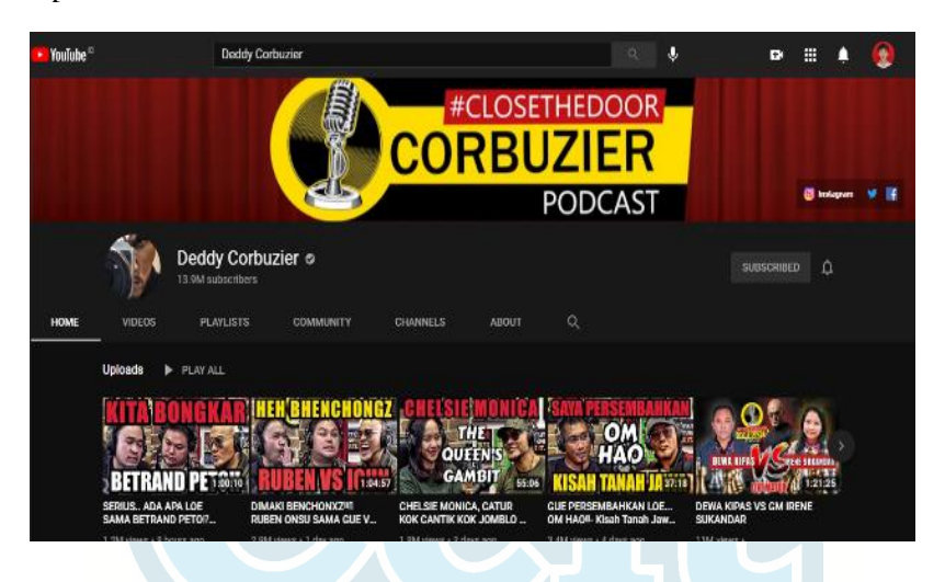
Figure 3: Deddy Corbuzier YouTube channel

The next observation goes to Deddy Corbuzier's YouTube channel. He is well-known to the public as one of Indonesia's most popular magicians. He launched his YouTube channel in 2009 and began regularly uploading in 2011. He amassed 13.9 million subscribers and 814 videos in less than ten years. Deddy's content is primarily focused on podcasts, motivation, strategic fundamental combat tips, and his various perspectives on current events. Each day, he uploads one video.